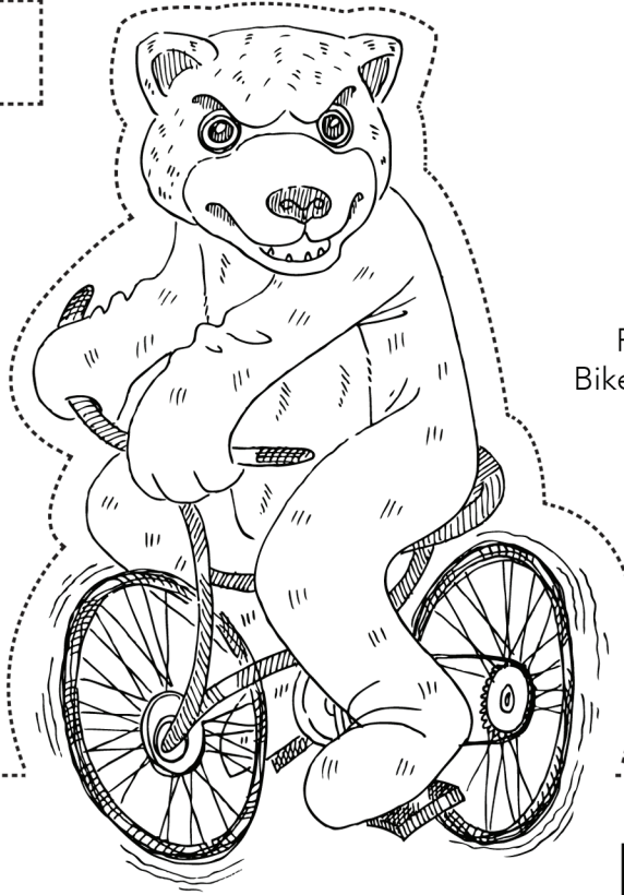
Portland Bike Thief Bear